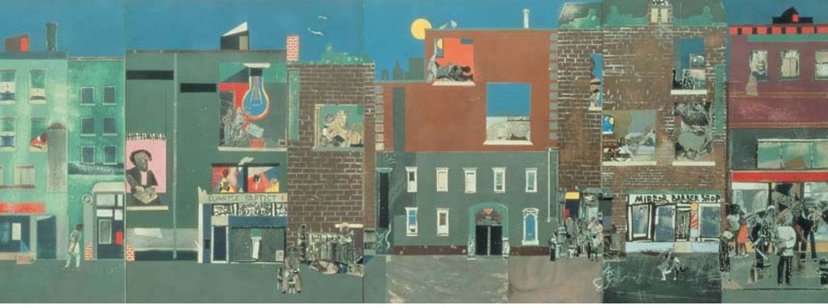
The Block, 1971 © Romare Bearden Foundation/Licensed by VAGA, New York, NY.