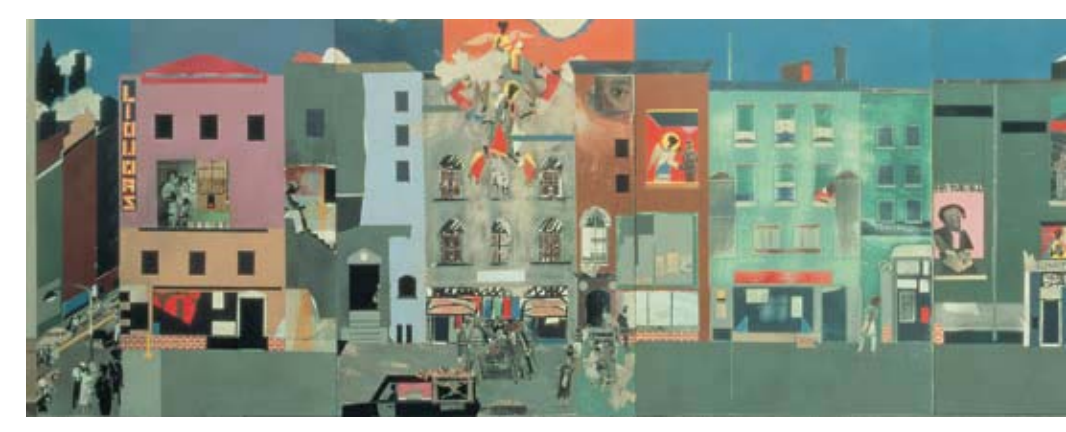
The Block, 1971 © Romare Bearden Foundation/Licensed by VAGA, New York, NY.